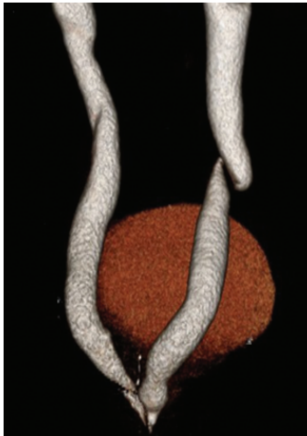
FIG. 2 CT-reconstructed posterior view of the ureteric anatomy showing ectopic ureteric insertion into the prostatic urethra.